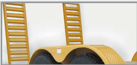
FM, FH & SL Series equipped with "Roughneck" diamond plated fenders.