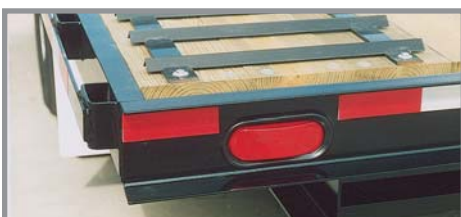
DO Series equipped with protected and recessed tail lights.