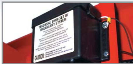
All Mac-Lander trailers are equipped with conduit enclosed wiring loom and safety brake-away kit with battery.