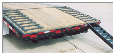
E-Z Crank Beavertail.