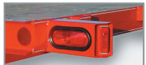
All tag-alongs equipped with reliable sealed beam tail lights.