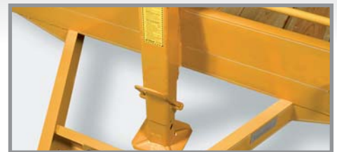
FH and SL Series equipped with heavy duty spring assist jack.